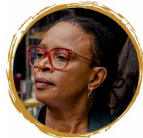
SIMPHIWE MBATHA MEMBER OF NATIONAL ASSEMBLY