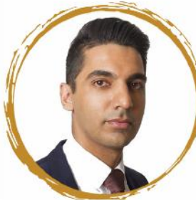
WASEEM CARRIM CEO, NATIONAL YOUTH DEVELOPMENT AGENCY