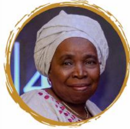
DR. NKOSAZANA DLAMINI ZUMA MINISTER IN THE PRESIDENCY FOR WOMEN, YOUTH AND PEOPLE WITH DISABILITIES, SA

Our Awards are carefully managed to guard the credibility and ensure their sustainability. The Awards are supervised by a Judging Panel of eminent Britons comprising the following: