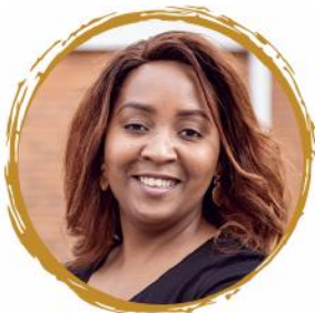
ANGELA SENOSHA POSITIVE SWITCH